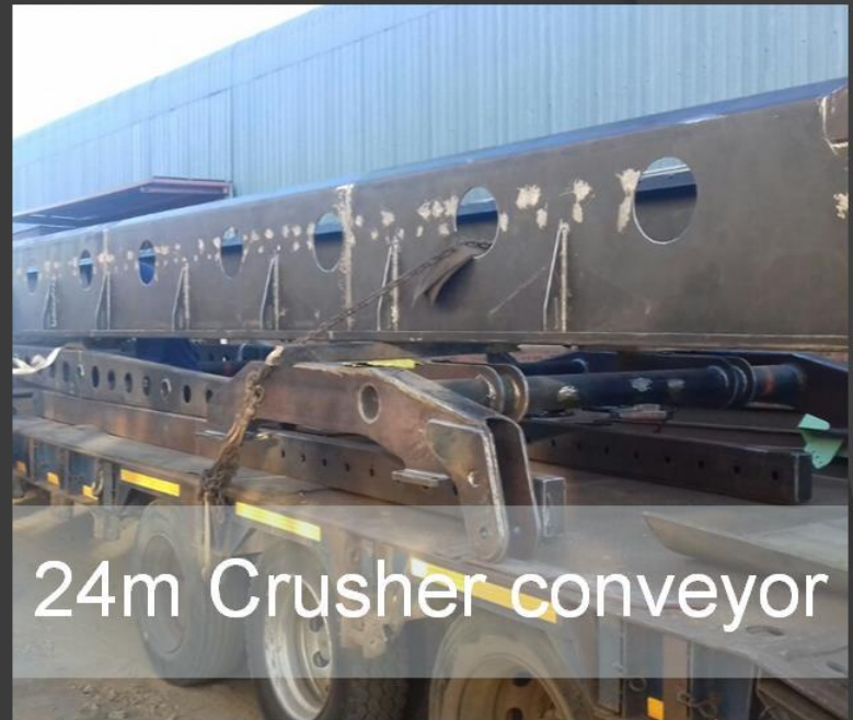
24m Crusher conveyor