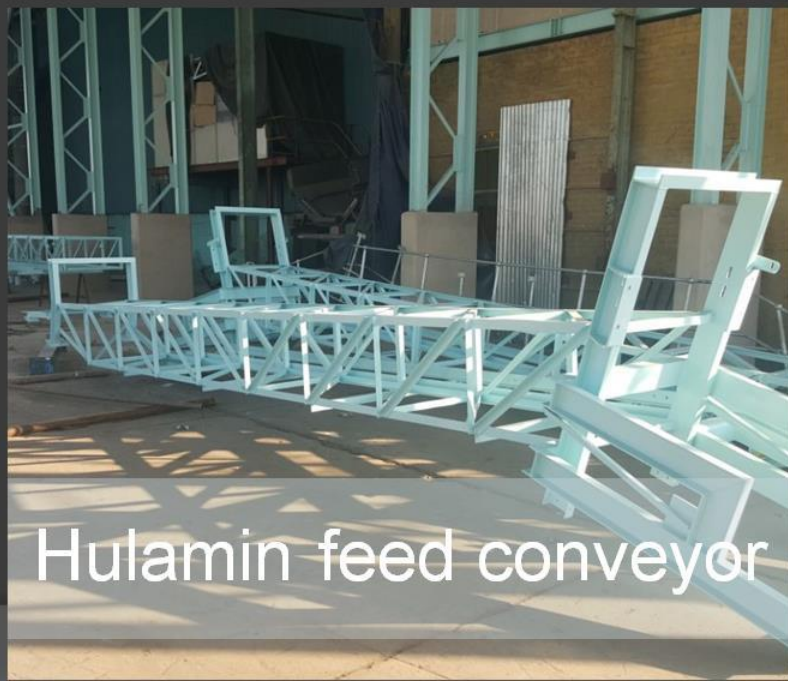
Hulamin feed conveyor