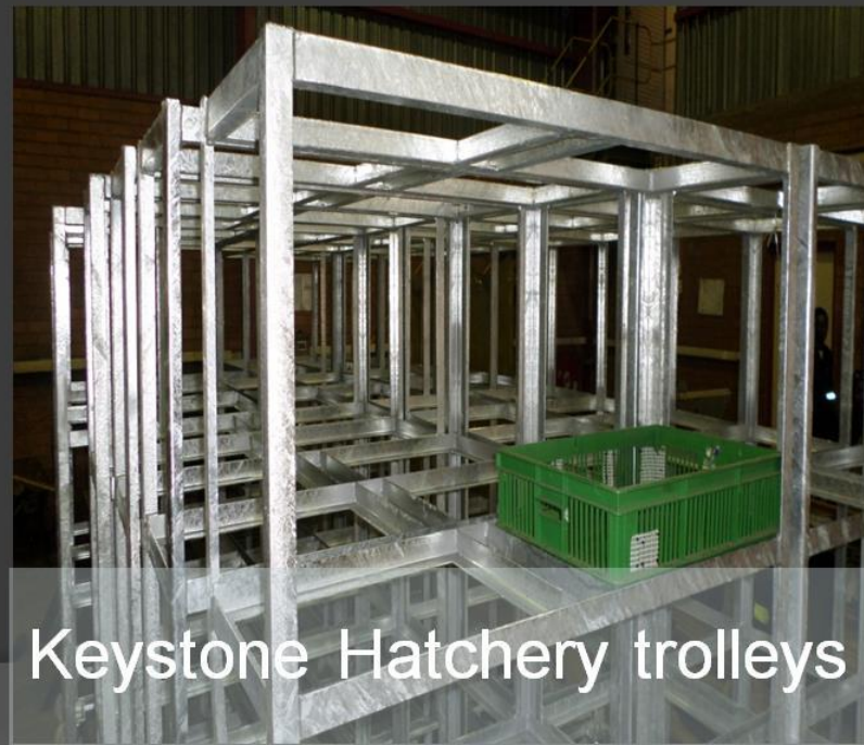
Keystone Hatchery trolleys