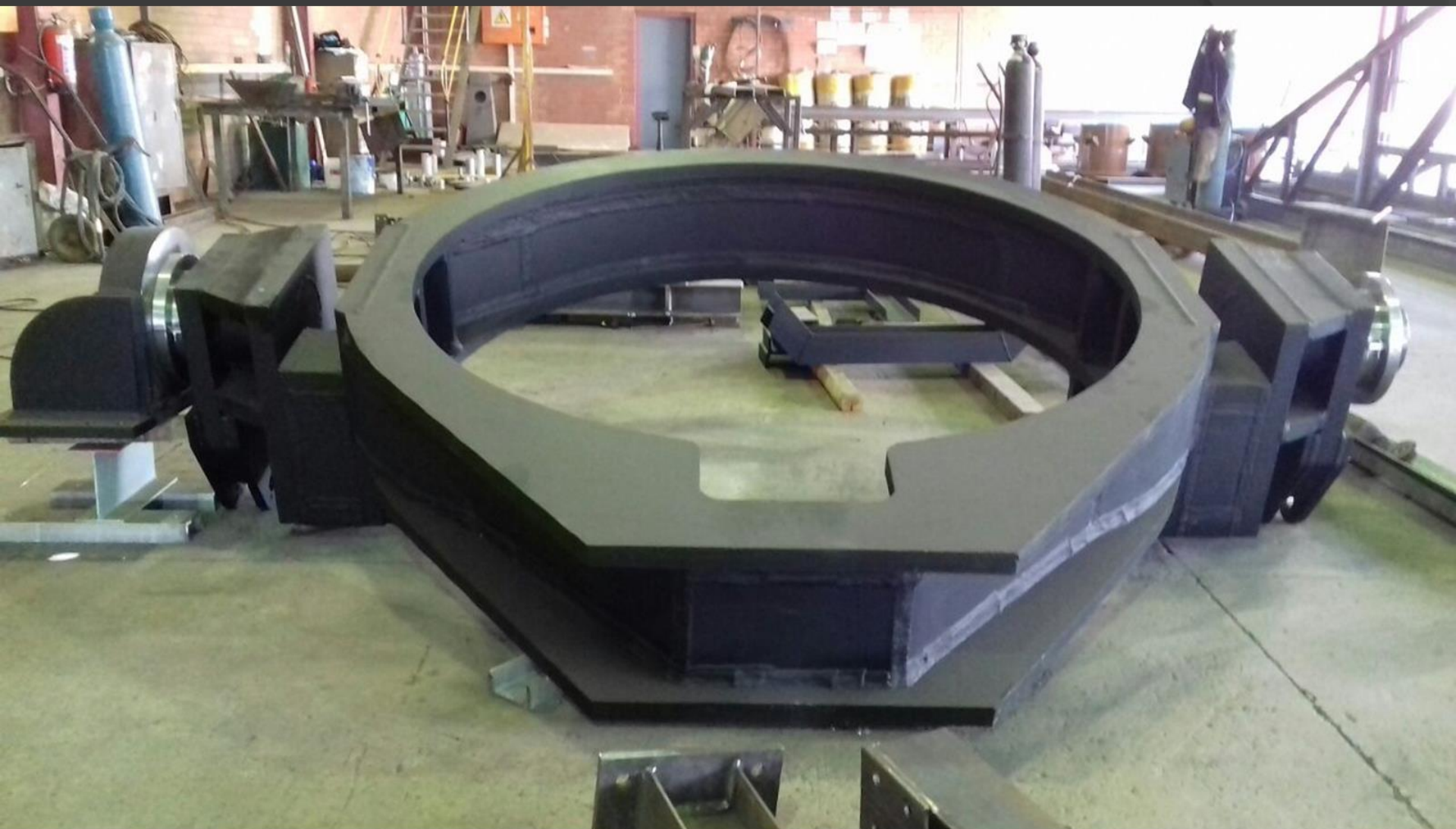
ASSMANG RABBLER RING