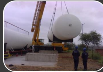
90 000 litre Vessel Installation