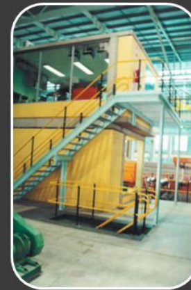
Stairway with Platform