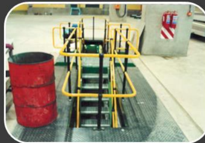
Basement Access Stairway & Platform