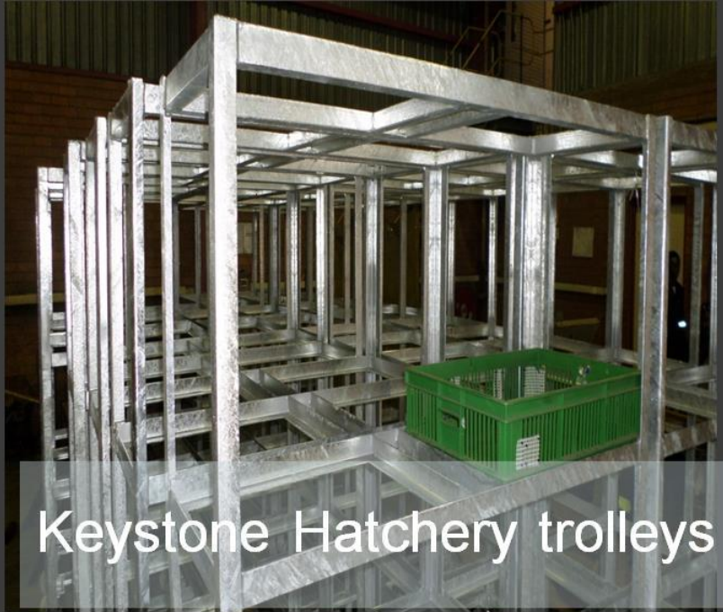
Keystone Hatchery trolleys