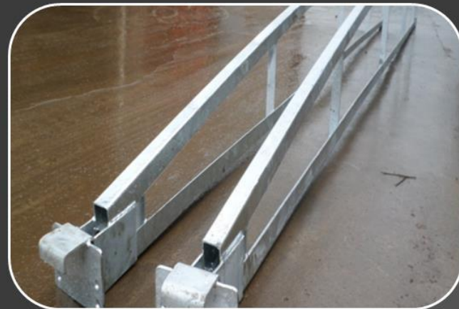
10m Tank Roof truss