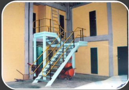
Split Level Stairways