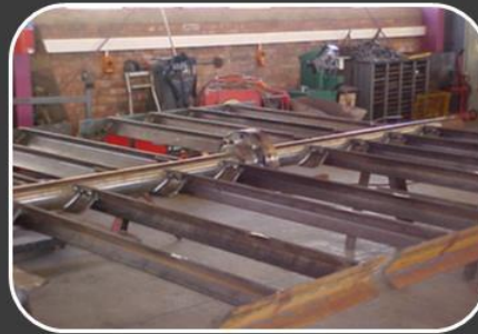
30 Ton Tanks Stirrer