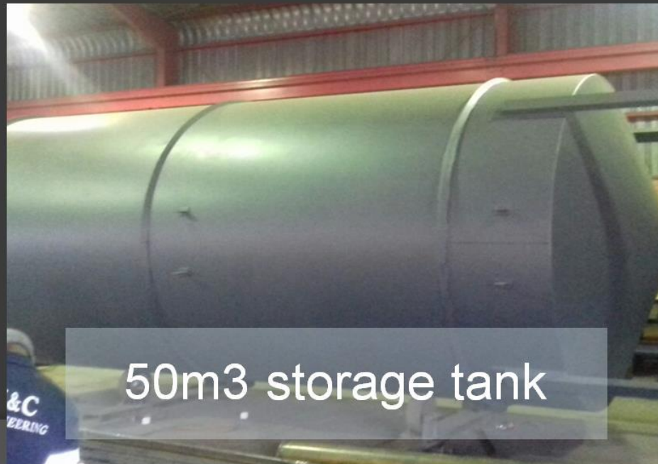
50m 3 storage tank