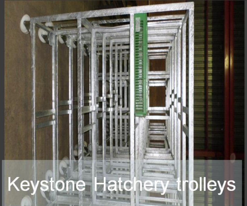
Keystone Hatchery trolleys