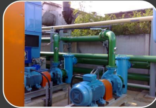
Cooling Tower & Pump Station