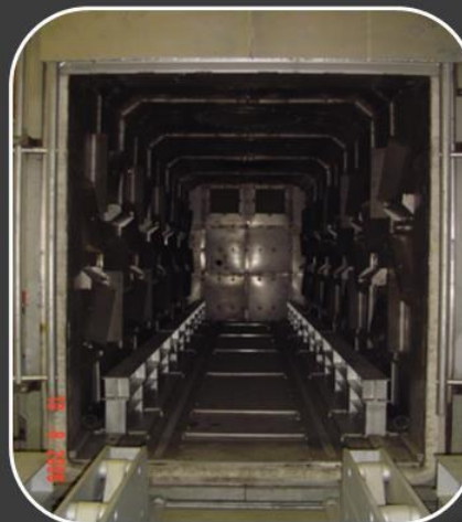
3 CR 12 Internal Cladding