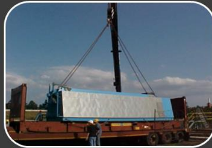
34000 litre LP Gas Vapouriser Installation