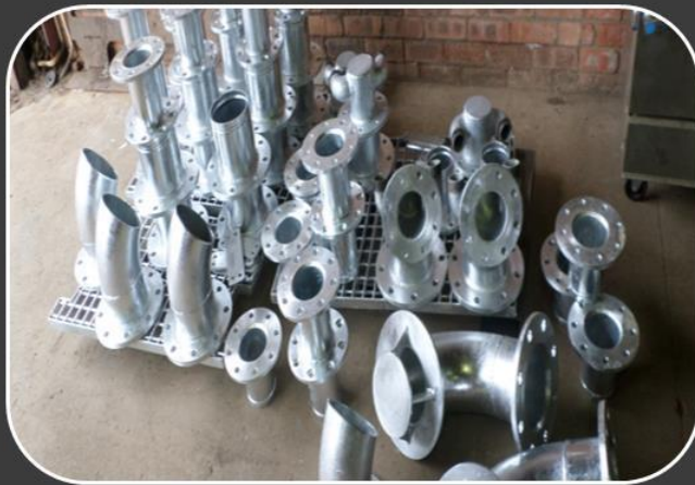
Water storage tank Pipe & Nozzles