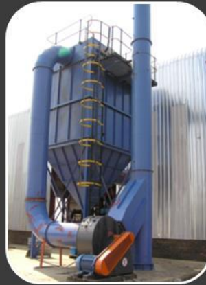
Dust Extraction System