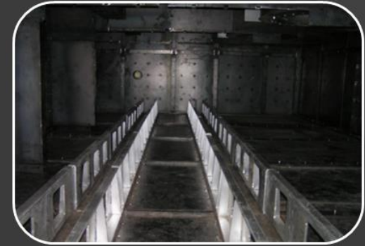
Mild Steel Internal Cladding