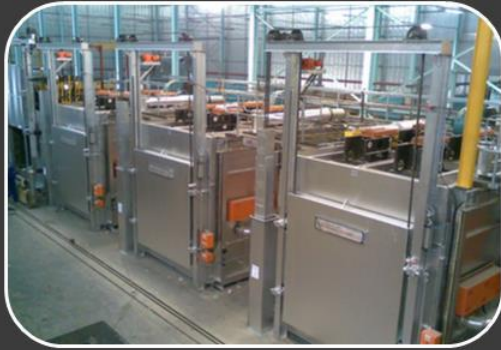
Foil Annealing Furnaces