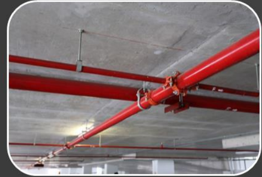
Fire water piping