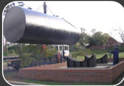
46 000 litre Fuel Tank Installation