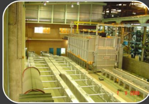
Coil Annealing Furnace & Cooling Racks