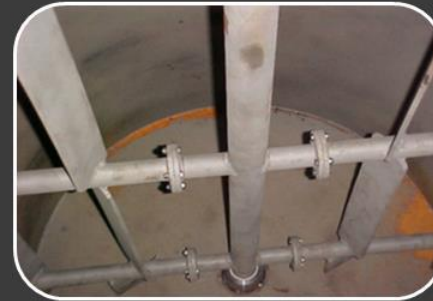
2 Ton Tank Stirrer