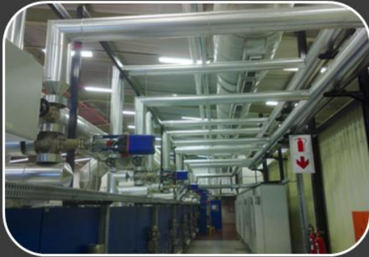
Thermal Oil Piping Claded