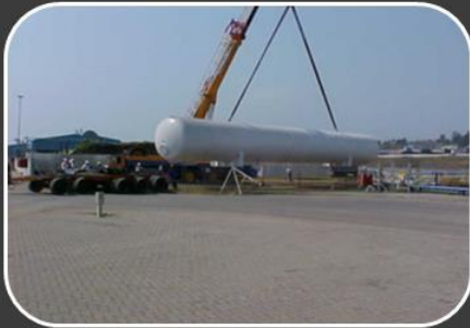
200 000 litre Vessel Installation