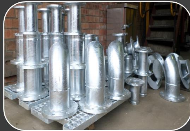
Water storage tank Pipe & Nozzles